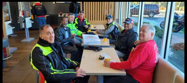
They all were ready to order hot coffee