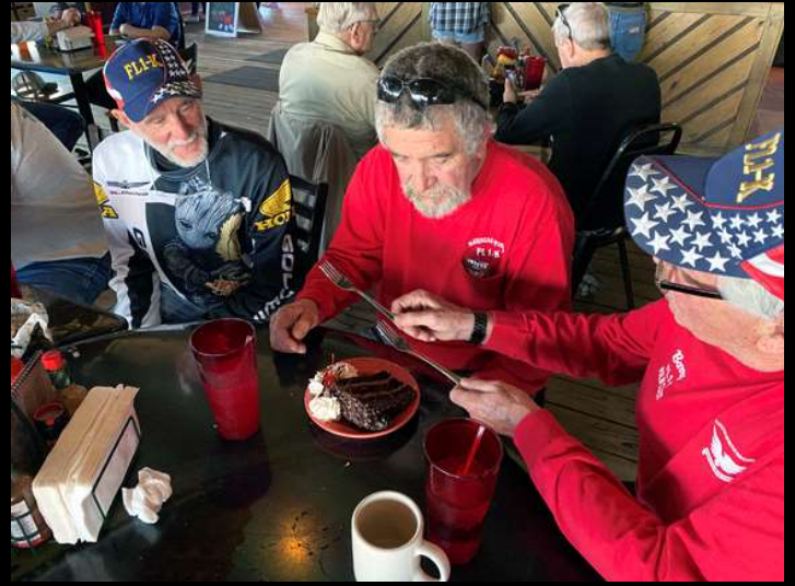
One piece of cake & 9 forks!