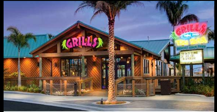
Cool outside....literally. About 40 deg, but it did warm up!