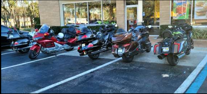
Riders were beginning to line up for the Freedom Ride