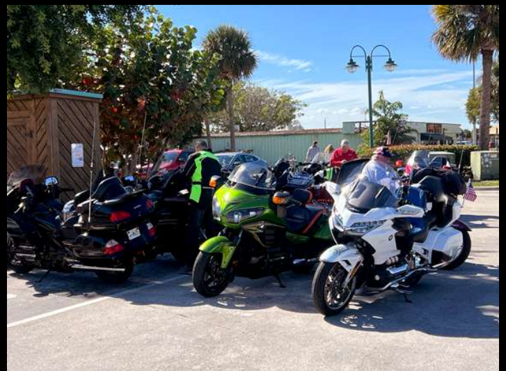
Time to saddle up and wind their way to Volusia & Flagler Counties