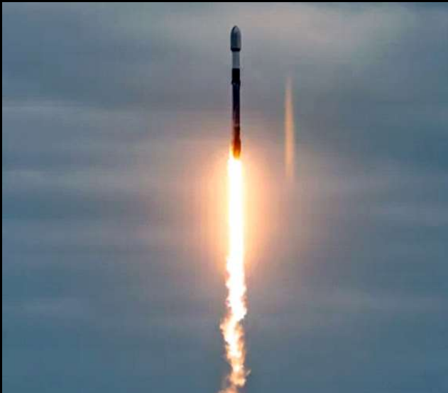
Surprise! The riders got to see a Space-X rocket rise into the clouds