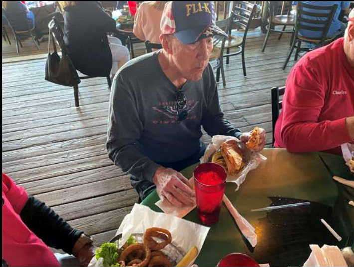
Sandwich baskets with onion rings! Yummy!