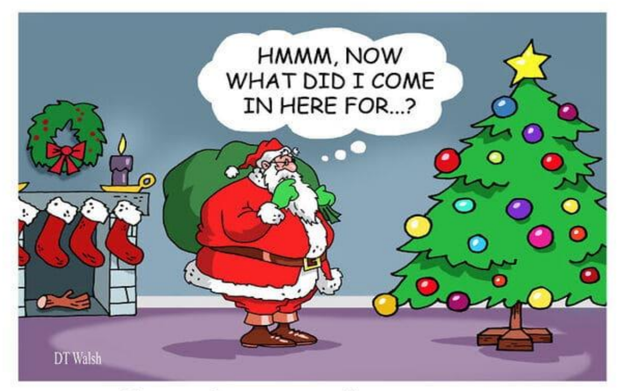
Santa has a senior moment