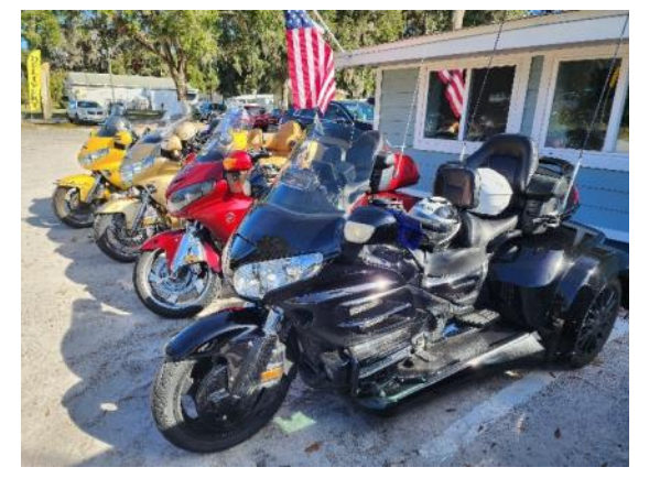
Continued on page 4)